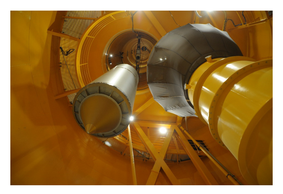
Figure 2: View up into the drop tower