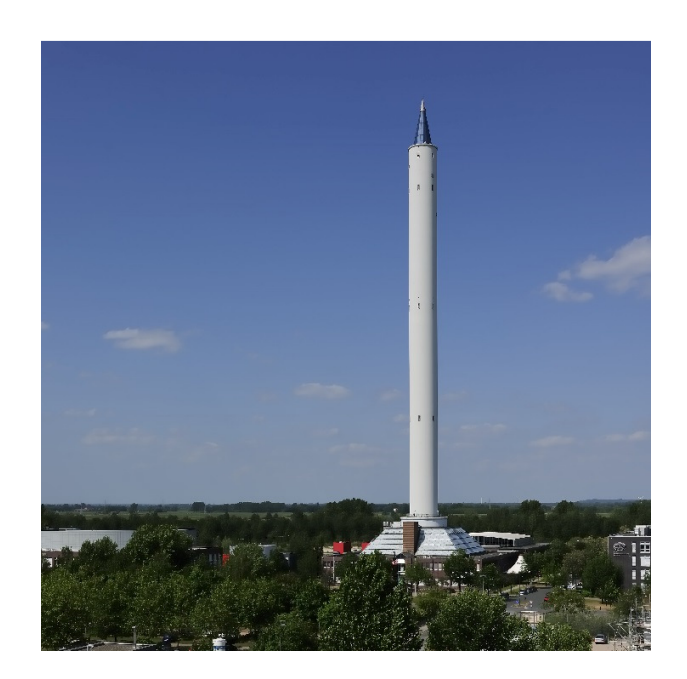
Figure 1: The drop tower building

to repeat the drop experiments many times. Further, the geometry of the capsule with circumference of approx. 600 mm imposed some restrictions (Fig. 3) as well as the need for the system to run off a battery pack during drop time.